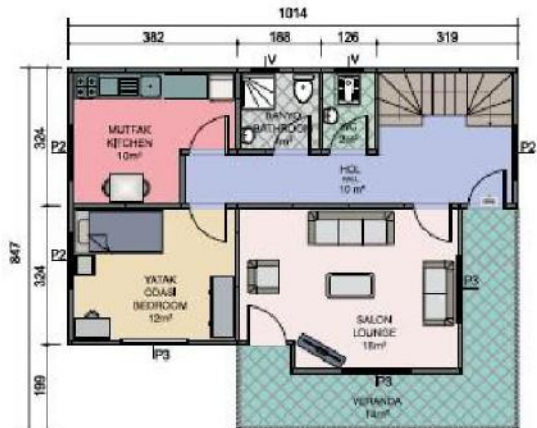
Zemin Kat Planı Ground Floor Plan 64m 2 + 14m 2 = 78m 2