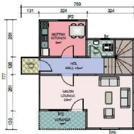
Zemin Kat Planı Ground Floor Plan 41\text{m}^2 + 6\text{m}^2 = 47\text{m}^2