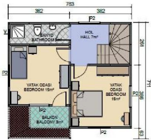
1. Kat Planı First Floor Plan 45\text{m}^2 + 3\text{m}^2 = 48\text{m}^2