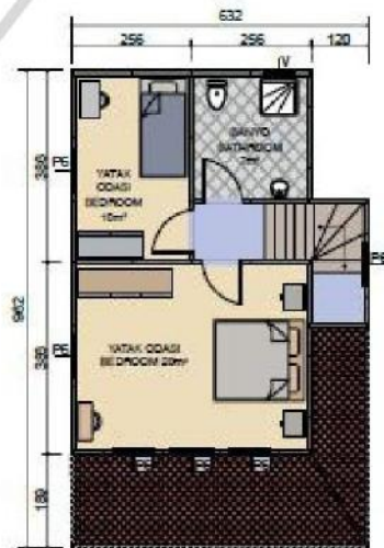
1. Kat Planı First Floor Plan 42\text{m}^2