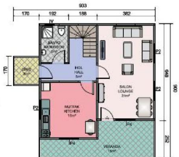
Zemin Kat Planı Ground Floor Plan 54m 2 + 18m 2 =72m 2