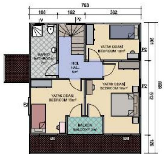
1. Kat Planı First Floor Plan 56m 2 + 3m 2 =59m 2