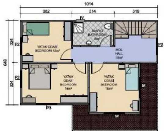
1. Kat Planı First Floor Plan 64m 2