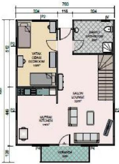
Zemin Kat Planı Ground Floor Plan 74m 2 + 5m 2 = 79m 2