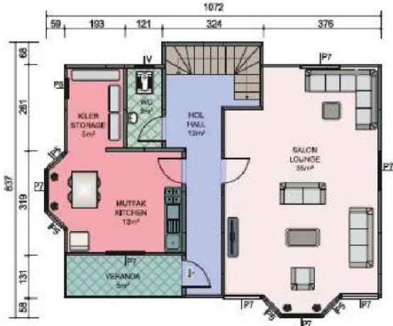
Zemin Kat Planı Ground Floor Plan 73m 2 + 5m 2 =78m 2