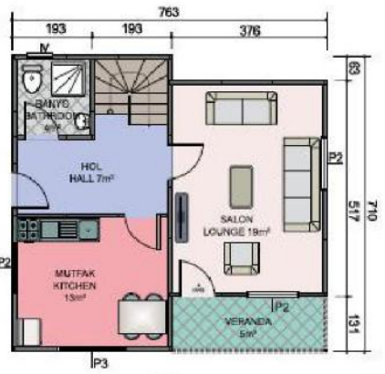
Zemin Kat Planı Ground Floor Plan 46\text{m}^2 + 5\text{m}^2 = 51\text{m}^2