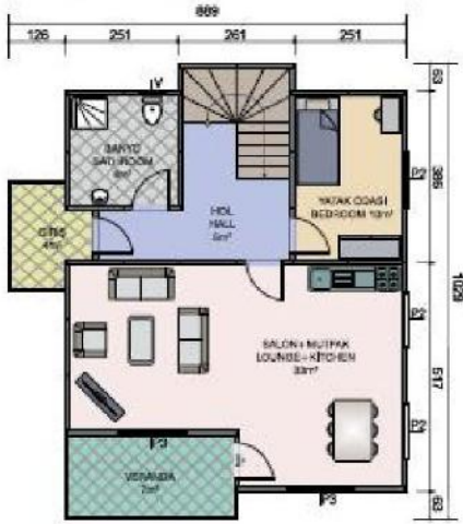
Zemin Kat Planı Ground Floor Plan 64m 2 + 11m 2 =75m 2