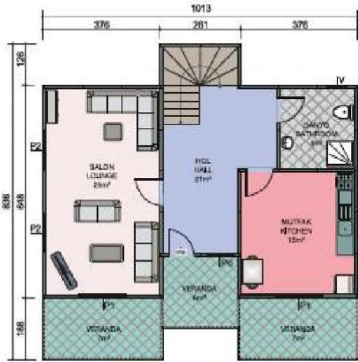
Zemin Kat Planı Ground Floor Plan 66\text{m}^2 + 20\text{m}^2 = 86\text{m}^2